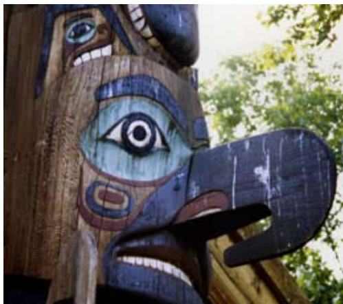
Ketchikan: Totem Bight State Park

Judge Sedwick wrote in his ruling that the 2003 decision by the U.S. Forest Service to exempt the Tongass from the national roadless rule was "arbitrary and capricious". As Sierra Club forest activist Mark Rorick, in Juneau, asserted, "It certainly was. The Tongass exemption was the result of a court settlement between the Bush