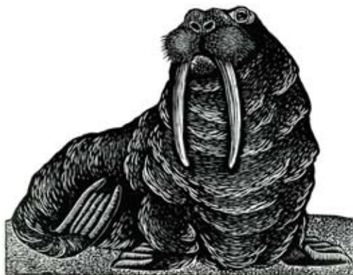
Bull Walrus © Dale DeArmond

An oil disaster is occurring in Norway's waters right now. On February 17, a tanker ran aground near Norway's only marine reserve, leaking some of its 204,800 gallons of