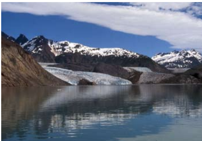
Glacier Bay National Park