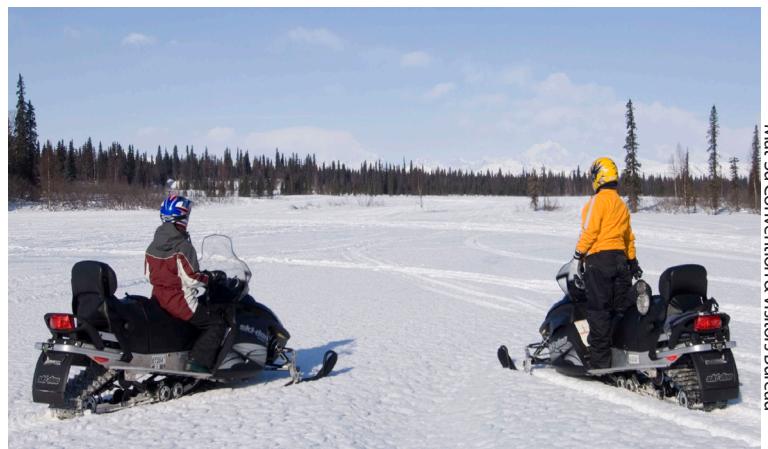
Mat-Su Convention & Visitors Bureau

An obvious misuse of the term "harvest". There are other perfectly usable words for the amount of wild animals killed by hunters and trappers, such as bag/bagged, consumed/consumption, kill/killed, and take/taken.