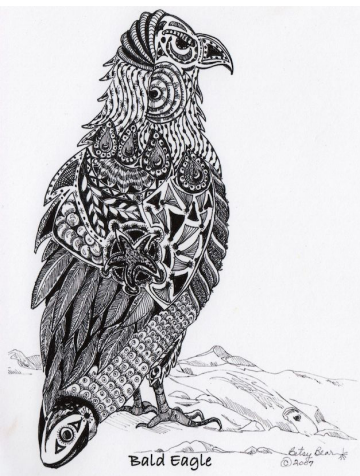
Betsy Bear Creations, North Pole AK

The experiences extend from the early 1980s to currently enrolled students. They include: faculty members repeatedly calling students racial slurs, a "Slave for a Day" fundraiser where Black students were auctioned off, staff normalizing racial abuses by peers, a student dressing in blackface for Spirit Week, and multiple instances of staff physically assaulting Black student athletes during sports events. These allegations implicate the current leadership at these institutions.