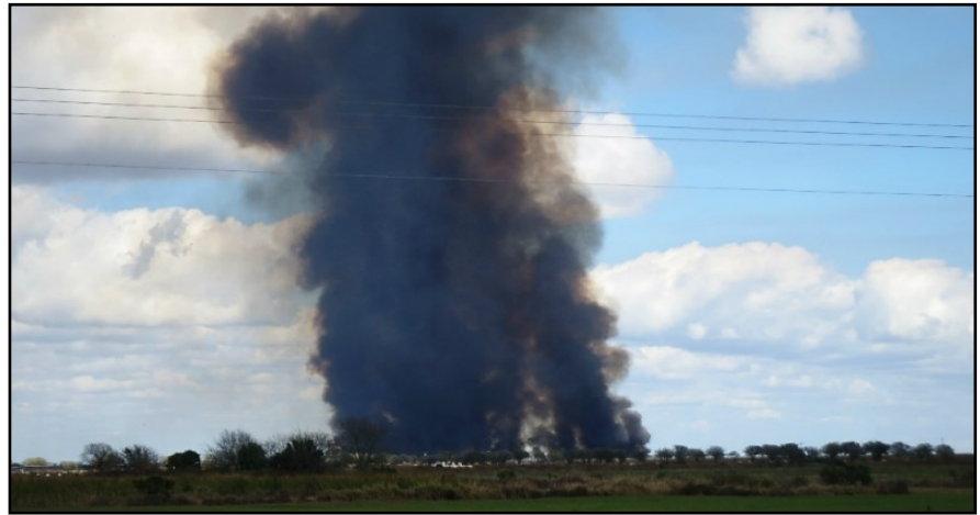
The dirty practice of burning sugarcane in South Florida takes a toll on the air, land, animals and people who live nearby. Below, Patrick Ferguson inspects a sugarcane specimen at the Native Brand laboratory in Brazil.

The Green Cane Project's sugarcane cultivation and production is 100% carbon neutral with soils that act as a carbon sink. In addition to supplying over a third of the world's supply of organic sugarcane and providing their own mulched trash soil amendments, they also produce bioethanol (including or-