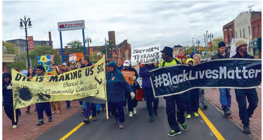
In 2016, EJ activists at the Detroit Marathon Refinery stood in solidarity with the Standing Rock Sioux Tribe to protest construction of the Dakota Access Pipeline on the reservation (now shut down pending a review) because of the threat to water quality.

This year, the Michigan Chapter has taken several steps to move us toward a