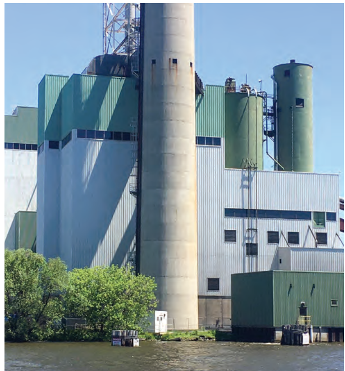
Remediation plans at the J.B. Sims Plant were postponed for the summer.