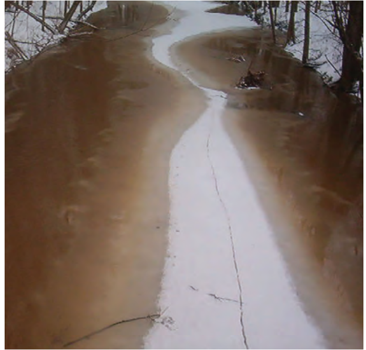
The agriculture industry opposes the new state ban on the application of animal waste on frozen and snow-covered ground from January-March, even though the practice leads to toxic runoff that feeds algae blooms.

The Michigan Environmental Council is heading up a legal response by a coalition of organizations intervening in the appeal process. The Sierra Club is exploring options for a legal response including the possibility of intervening with several other groups in the appeal process.