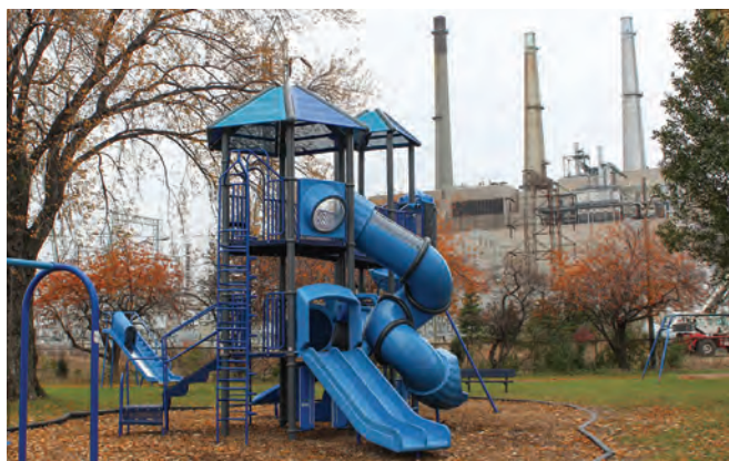
River Rouge children live in the state's most polluted zip code.