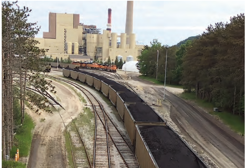
Consumers Energy plans to retire the J.H. Campbell coal plant.

More recently, we led a coalition of more than 75 organizations, businesses and elected leaders to launch a climate justice campaign targeting Consumers Energy. Shortly thereafter, the utility responded by proposing to retire its J.H. Campbell coal plant in 2025, moving the retirement up 15 years from 2040! While they did not propose building a new gas plant, the company is planning to purchase four existing fossil gas plants.