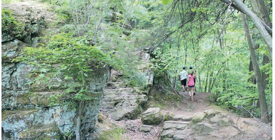
Coming soon to a natural area near you...Spring! Pictured are hikers exploring flora along the Grand River in Grand Ledge's Fitzgerald Park.

Plant and others and push for a 100 percent clean energy future for Michigan (pp. 8-9).