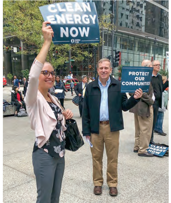
Volunteers attending the protest during the EPA Affordable Clean Energy hearings.