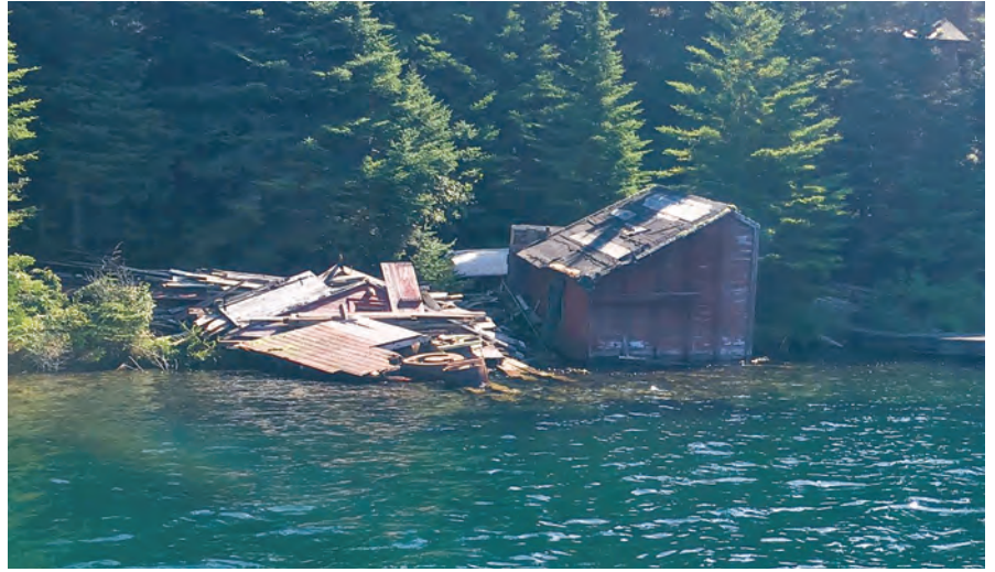
As can be seen in this photograph of the "Mattson Fish House", the need to decide whether to demolish or stabilize some buildings on Isle Royale is urgent.

The 2019 Winter Study is the first survey since relocation of the new wolves and will be critical in determining the outcome of the transplant effort. When the federal government reopened on January 25, the study recommenced, but during the shutdown a wolf had left the island. Because of the disruption, the disappearance was not discovered until after the shutdown, whereas if operations had not been interrupted, it would have been discovered in real time. If the shutdown had lasted much