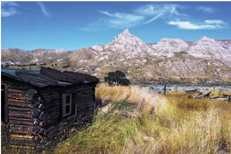
Hagadone Homestead on the Missouri River Breaks.

http://www.epa.gov/climatechange/ghgemissions/global.html