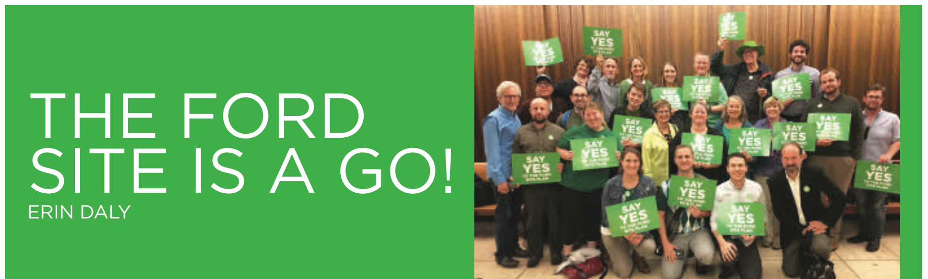
Ford Site proponents celebrate over a decade of advocacy.

The annual Sierra Club Bike Tour is organized by the Land Use and Transportation Committee. To learn more contact joshua.houdek@sierraclub.org or 612-259-2447.