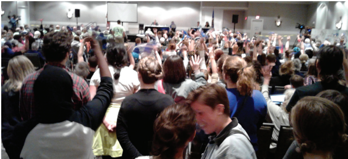
Those seeking to stop Line 3 greatly outnumbered supporters at a Sept. 28 public hearing in downtown St. Paul.

Things are coming to a head around the Enbridge Line 3 tar sands pipeline.