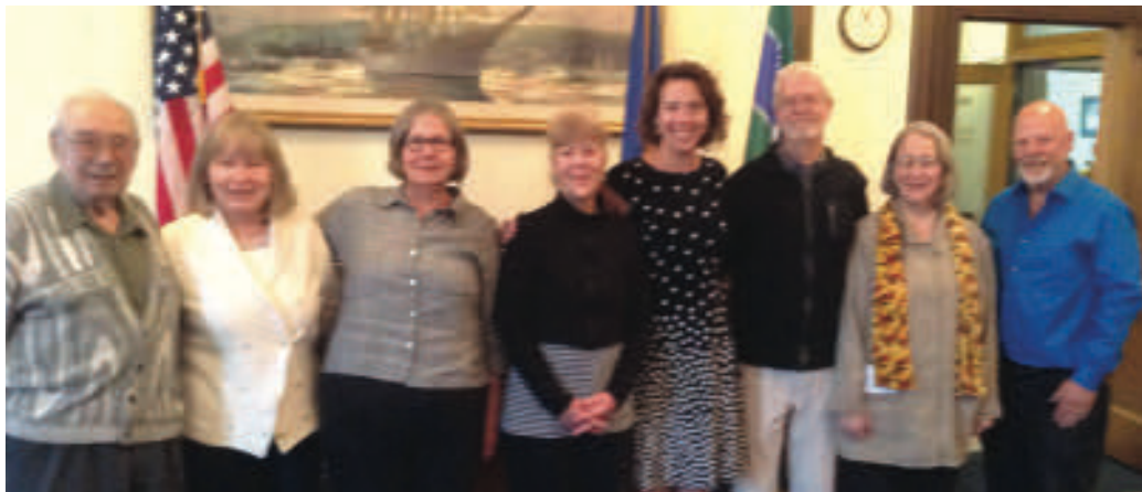
Duluth Energy Team met with Mayor Emily Larson to discuss the city's clean energy future.

Northern Minnesota Sierra Club Clean Energy Team members have been busy throughout the summer and fall working to promote clean energy, air and water. Several members of the Duluth Sierra Club team joined with other environmental groups including Minnesota Interfaith Power and Light, Ecolibrium 3, Citizens Climate Lobby, Izaak Walton League, McCabe Chapter, and Honor the Earth to work with on the City of Duluth's Comprehensive Planning 2035 process. The plan supports a city adoption of the greenhouse gas emission reductions proposed by Mayor Emily Larson in 2017 and also included in the Paris Climate Accord: 15% GHG reduction by 2020 and 80% reduction by 2050. Several members met with Mayor Larson in June to present Sierra Club's 100% renewable energy cities campaign (see photo).