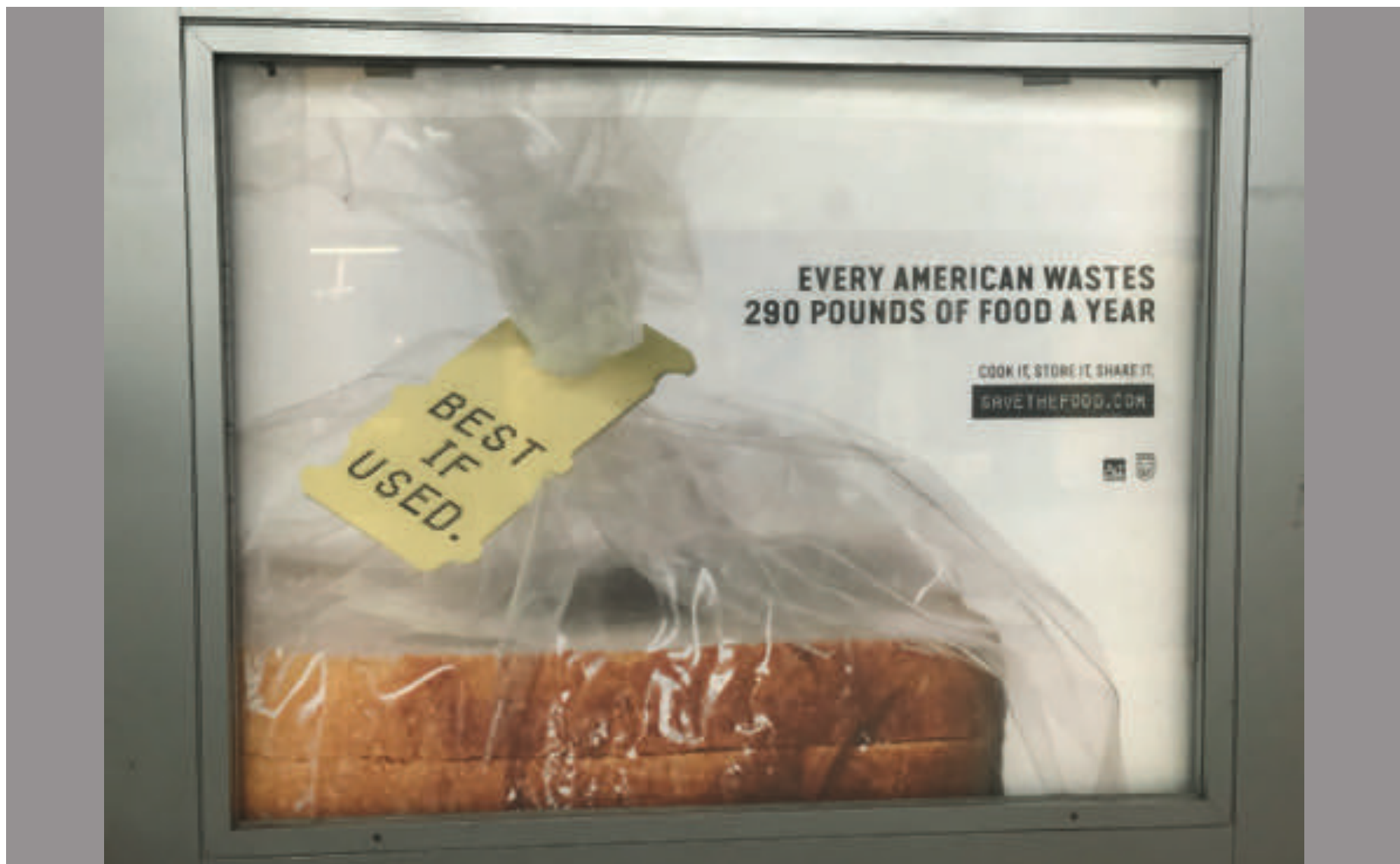
Photo description: Metro Transit ad for SavetheFood.com, Minneapolis