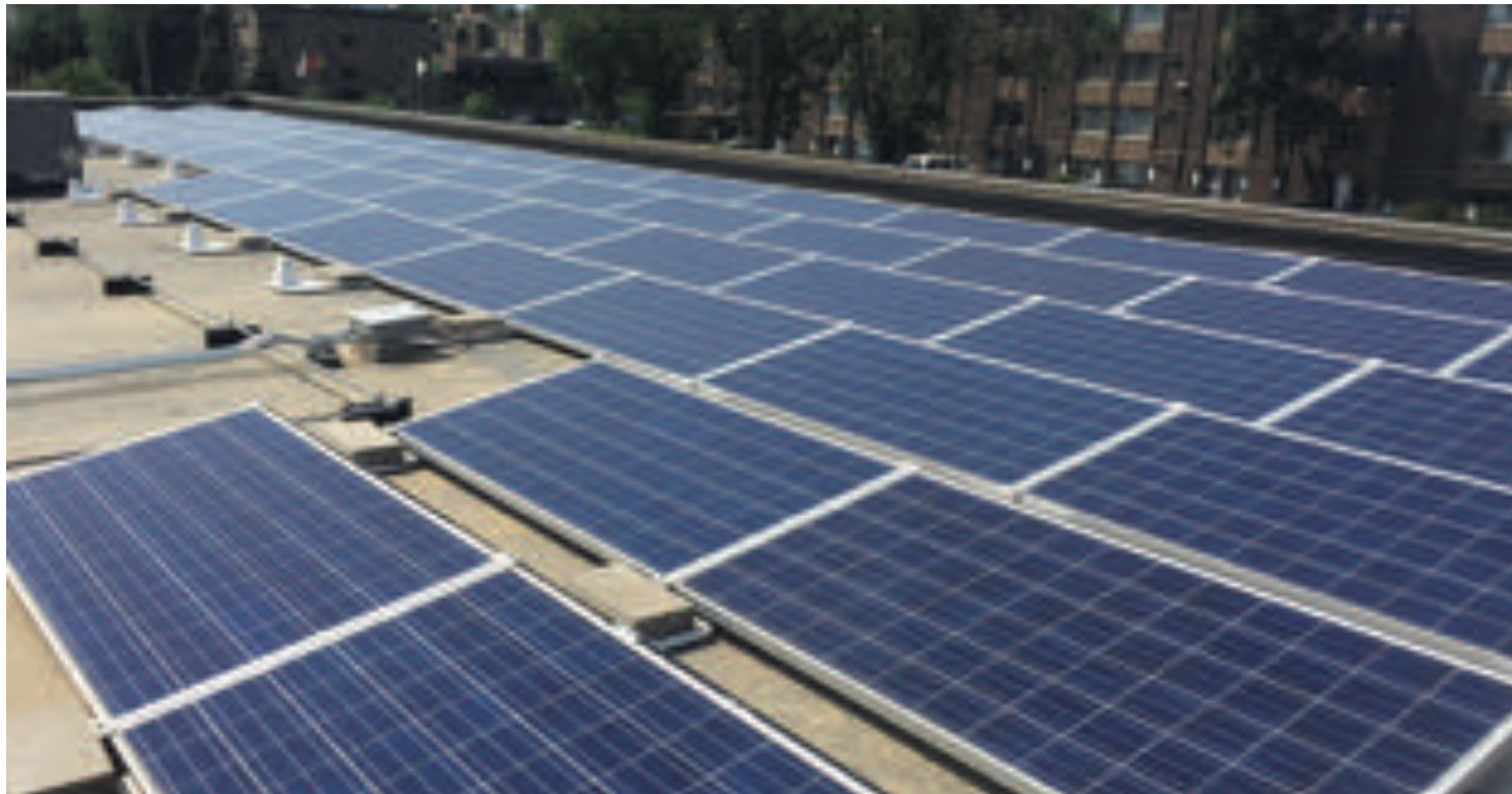
Solar panels above the Sierra Club office.

Solar energy: clean, abundant, free. On an individual level, property owners could—in theory—liberate themselves from dependence on fossil fuels by devoting sun-drenched square footage to a solar array.