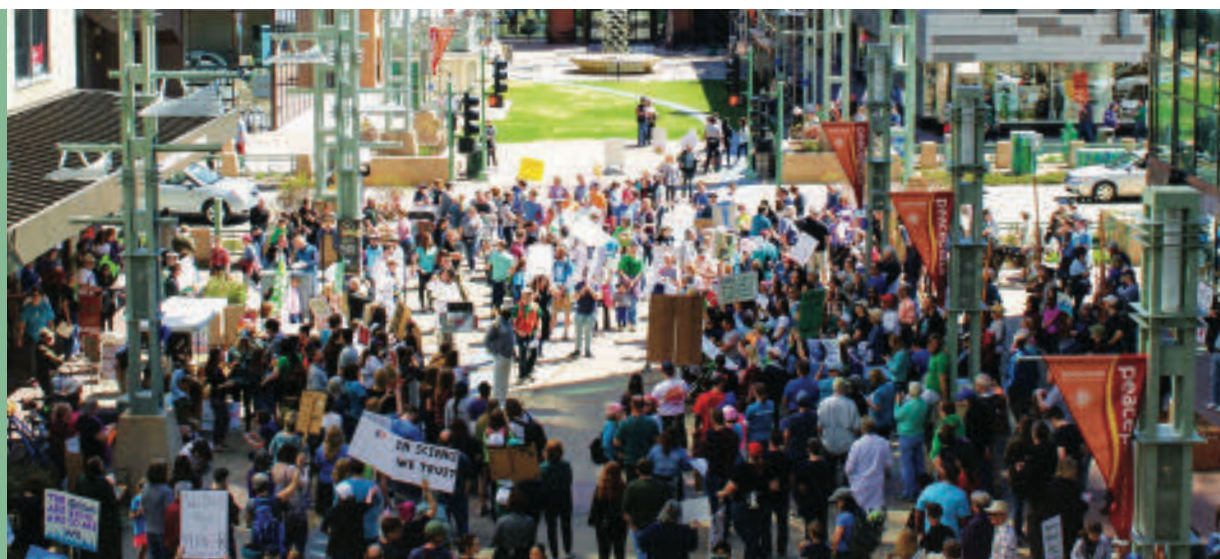
Rochesterites gather in the Peace Plaza for the city's largest ever People's Climate March.

2017 has been a year of firsts for energy policy in Rochester, and the Sierra Club has been in the thick of it each step of the way. The year began in the most exciting way possible – with city budget discussions. After months of building mounting pressure on the Destination Medical Center's (DMC) economic development agency, its board created a new sustainability director position. The city government was so convinced by the case for sustainability staff for the DMC that they gave additional funding so the position would also work on making