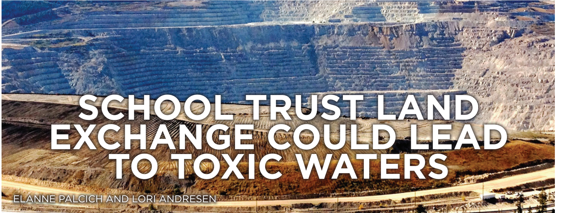
Example of a Teck Resources copper mine in British Columbia. This could be coming to Superior National Forest, based on Teck's known deposits.

Toxic copper-nickel sulfide mining continues to threaten Superior National Forest (SNF). The United States Forest Service (USFS), already planning a land exchange with PolyMet for its proposed toxic open pit sulfide mine, now plans to trade additional acreage that would facilitate more such mining. Only now it's being done in the name of our school children.