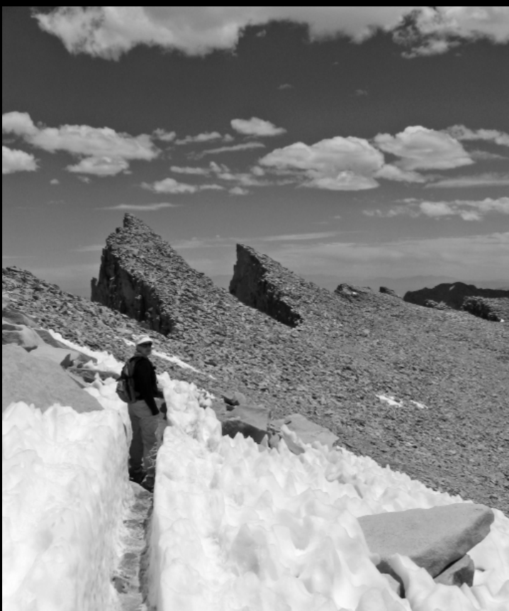
Near the summit of Mt. Whitney, on the Whitney/Panamint outing in July.