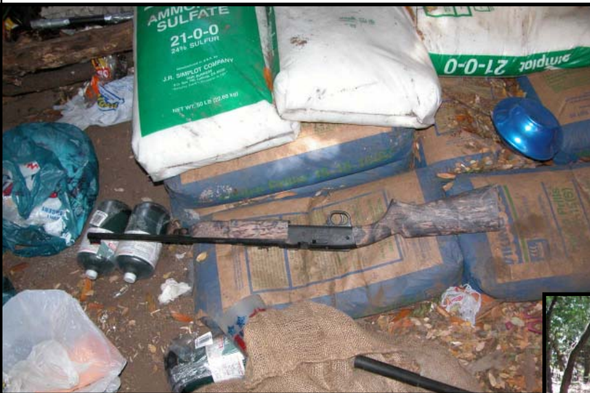
An abandoned stockpile of fertilizer and firearms, as it was discovered by Park Service officials.