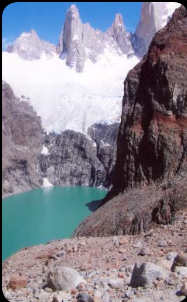
Hiking Glaciers in Patagonia

Mark your calendars for our annual planning meeting on Saturday, July 23 rd . We'll look to the year ahead, discussing environmental issues of local concern, brainstorming speakers and outings for the year ahead, and ironing out the details of our December banquet. We'll start at 9:00 A.M. and probably finish around noon for a potluck lunch of salads and desserts. Location to be announced. ( www.tehipite.sierraclub.org/Groups/Merced/ )