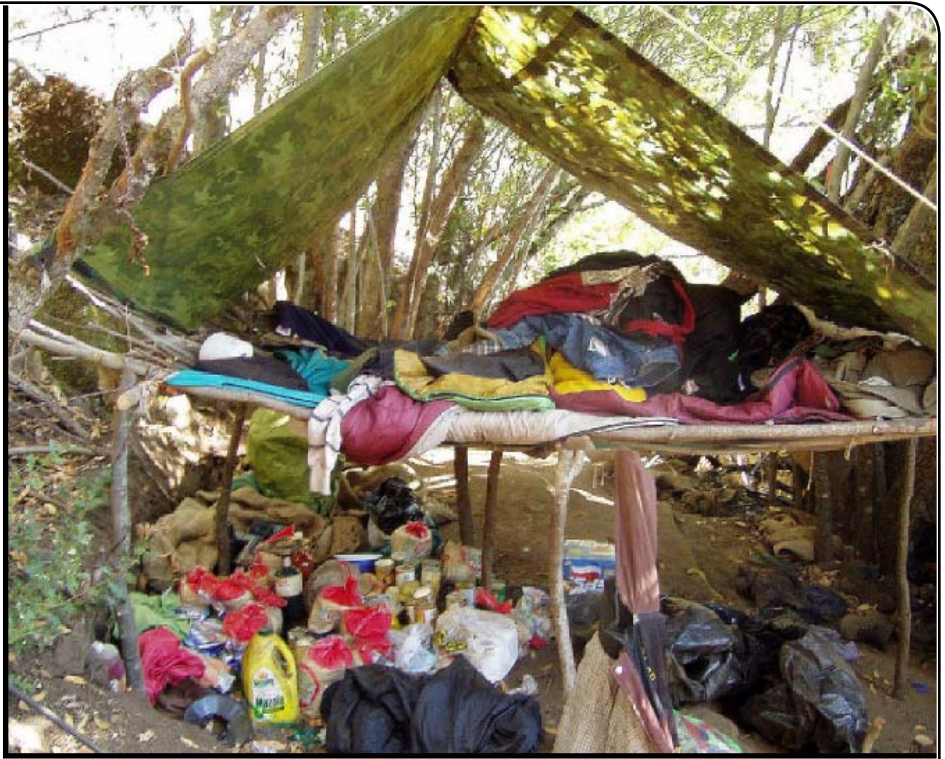
Marijuana growers have erected elaborate camping platforms in the forest. Unsafe storage of food items poses a threat to bears and other wildlife. Crews have restored 13 of these camps.

Though the Park Service has been conducting surveillance and eradicating marijuana farms within Sequoia Park since 2001, only about half of the damaged areas have been