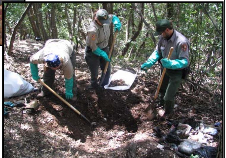
Restoration workers excavate a garbage dump left by marijuana growers. The Park Service removed 5,515 pounds of garbage from 25 of these pits.

restored. Funds for restoration have only recently become available, and they remain in short supply. Restoration is expensive. In addition, the heavily armed growers present a serious threat to restoration workers. They must do the majority of their work between November and February to avoid confrontation with the growers. The restoration is not an easy task, and much more work remains to be done.