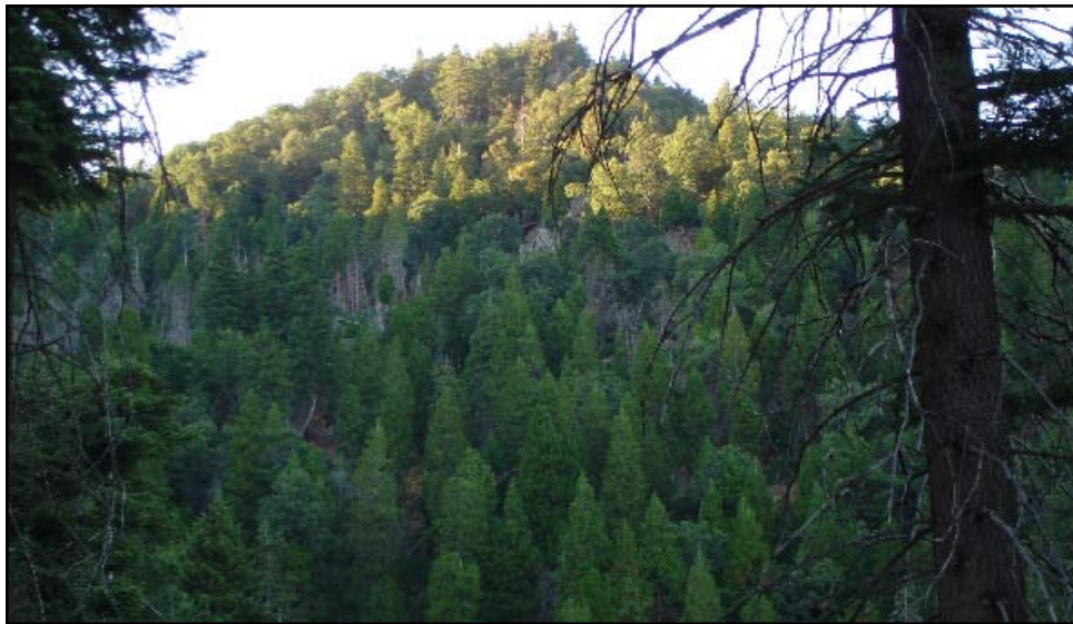
Saved from logging! Cold Springs Peak, inside Saddle Sale unit 161.

We are outraged that the Forest Service did not take seriously its responsibility to protect this wondrous forest. The Sierra Club has another lawsuit pending, which challenges the Forest Service's Sequoia Monument Management Plan, because it perpetuates