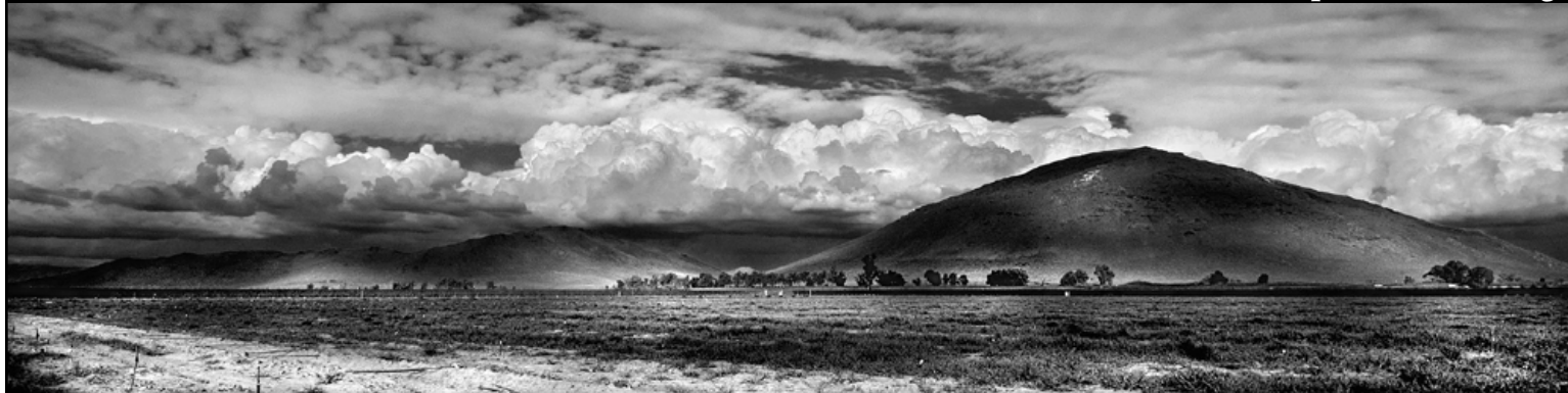
Jesse Morrow Mountain