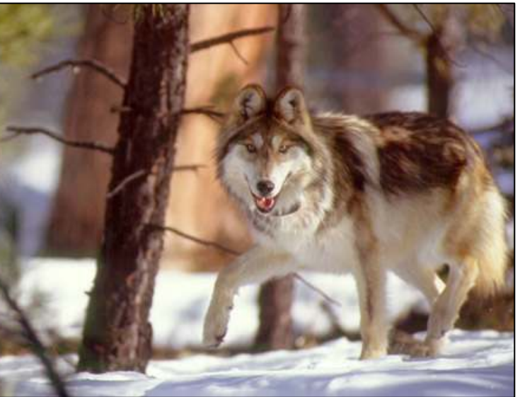
WITH ONLY 58 LEFT IN THE WILD, THERE IS NO NORTH AMERICAN LAND MAMMAL MORE ENDANGERED THAN THE MEXICAN GRAY WOLF. LIVING IN THE REMOTE MOUNTAIN FORESTS AND GRASSLANDS OF ARIZONA AND NEW MEXICO, NO ONE HAS SIGHTED A WILD WOLF SOUTH OF THE BORDER SINCE 1980.

controversial wind project in a sensitive area of the Sierra has been found threatening to endangered California condors and golden eagles. While more than 700 species have qualified for protection, 3,000 imperiled species await official decisions, and 600 eligible candidates deserving protection may have a long wait. Meanwhile, the Wise Use movement, a powerfully funded, industry-based coalition of developers, timber-mining-oil companies, agribusiness firms, large water users, and off-road vehicle manufacturers has mounted a massive campaign to undermine the ESA, and Congress is working to slash current funding.