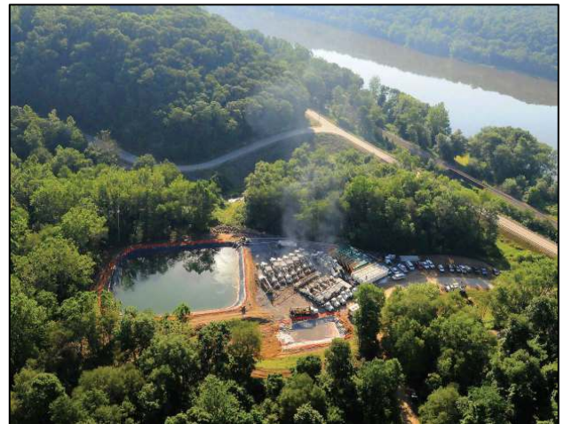
A HYDRAULIC WASTE POND SO CLOSE TO A NATURAL WATERWAY