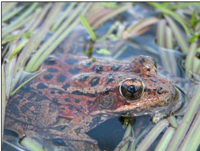
DEGRADED WATER QUALITY FROM AIR AND SURFACE POLLUTION THREATENS MANY SPECIES OF AMPHIBIANS, INCLUDING THE CALIFORNIA RED-LEGGED FROG.

The Endangered Species Act (ESA) of 1973 has saved many species such as the red wolf, the whooping crane, and the peregrine falcon from imminent extinction. Fortunately, our national bird, the bald eagle, has also made a comeback after being shot, electrocuted by power lines, and poisoned by ingesting shotgun pellets. A