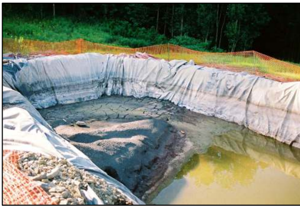
A HYDRAULIC WASTE POND AT A DRILLING SITE — IS THE GROUNDWATER ADEQUATELY PROTECTED?

Fresnoans Against Fracking faces a daunting task in convincing Fresno County residents to support making the Valley a “Frack-Free Zone.” We are up against a popular political will to embrace any enterprise that guarantees the creation of new jobs when their local economy is depressed, regardless of adverse social and potentially dangerous environmental consequences. Without adequate insight into the risks fracking poses to invaluable natural and social resources, current hardships will send the public running headlong into a disastrous future.