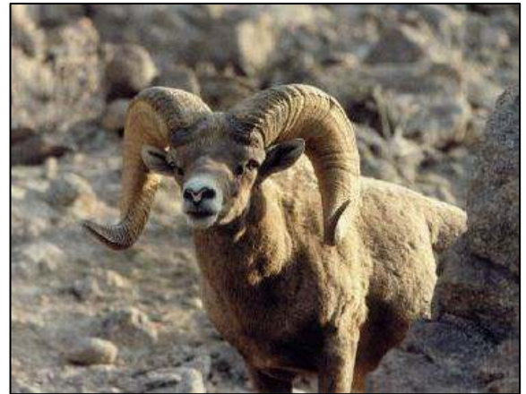
A PNEUMONIA OUTBREAK, BELIEVED TO HAVE KILLED TWENTY ENDANGERED BIGHORN SHEEP THIS PAST MONTH IN MOJAVE NATIONAL PRESERVE, THREATENS HUNDREDS IN THE STATE'S BIGGEST HERD AS WELL AS MANY MORE IN NEARBY NEVADA.

On a typical day, ten to forty species will become extinct forever, many as a result of tropical deforestation. Since 1600, 185 species of mammals and birds have become extinct. The number rises to 20,000 if invertebrates and plants are included. This tragic loss weakens the delicate "web of life" which supports our planet's biosphere, and threatens the survival even of human species. Many "indicator species" (like the canary in the coal mine) provide clues to the health of a whole ecosystem, and act as an early warning system to protect us. The threat to the spotted owl, for example, warns us to stop destroying our ancient Northwest forests; a decrease in marsh birds signals that our wetland ecosystem is endangered as well. Pollution off our coasts is killing coral reefs and hundreds of species of fish. We depend on the healthy ecosystems of the ancient forests, coastal estuaries, grasslands and wetlands to purify our air, clean our water and supply us with food. The loss of a single species