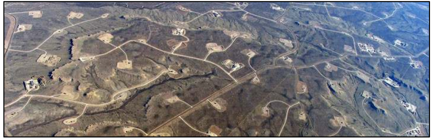
THIS FRACKING FIELD LEAVES QUITE A FOOTPRINT ON THE LANDSCAPE