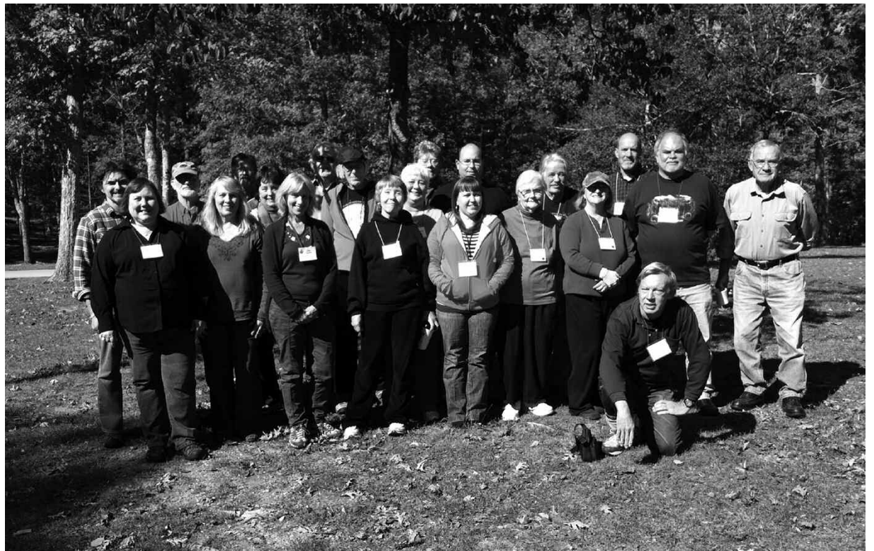
Fall 2011 Chapter meeting group photo. Find out about the winter Chapter meeting on page 3.